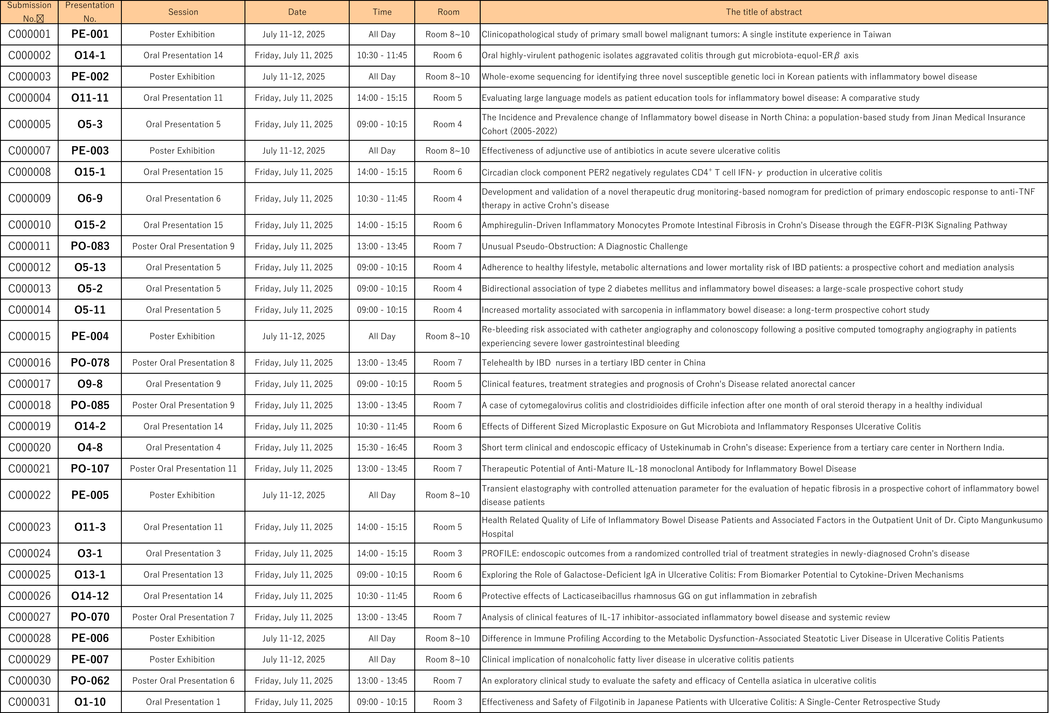
AOCC2025 - List of Accepted Abstracts (by Submission Number)